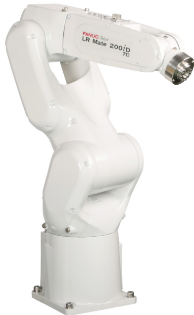
LR Mate 200iD

LR Mate 200iD/7C Clean room, food grade grease (2 integrated solenoid valves)