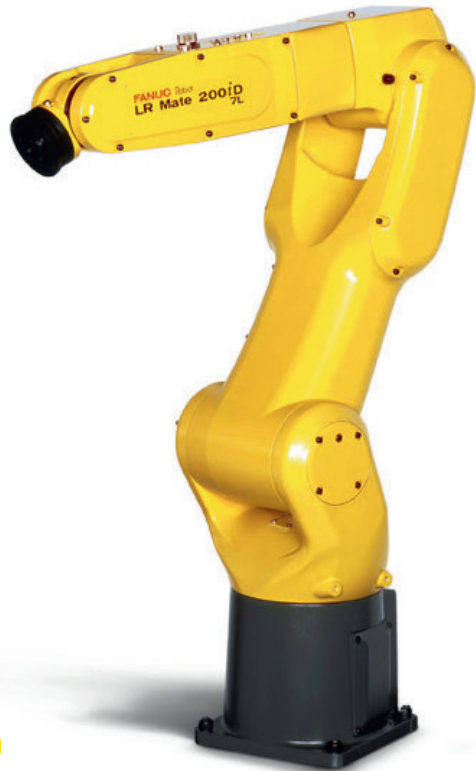
LR Mate 200iD

Operating space of J5-axis rotation center